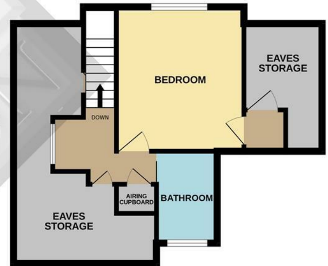
1ST FLOOR 433 sq.ft. (40.2 sq.m.) approx.