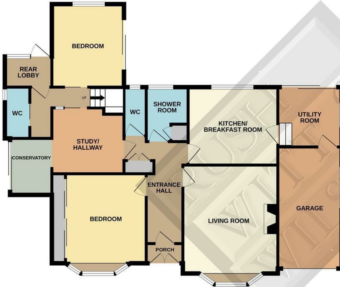
GROUND FLOOR 1150 sq.ft. (106.9 sq.m.) approx.